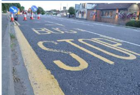
Home to School Transport cuts criticised by parents

Published by Local Democracy Reporter, Local Democracy Reporter at 12:46pm 2nd December 2018.