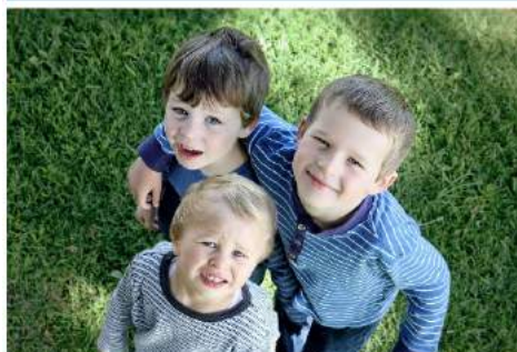
Plan to tackle social care recruitment crisis in Bucks

Published by Local Democracy Reporter, Local Democracy Reporter at 7:25am 29th January 2019.